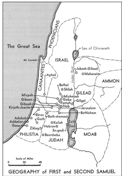
Map of David's Kingdom-ESV Global